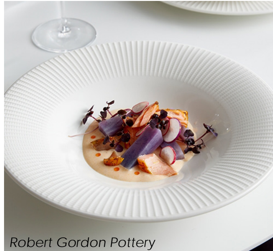
Robert Gordon Pottery