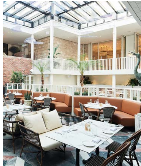
The Continental Hotel