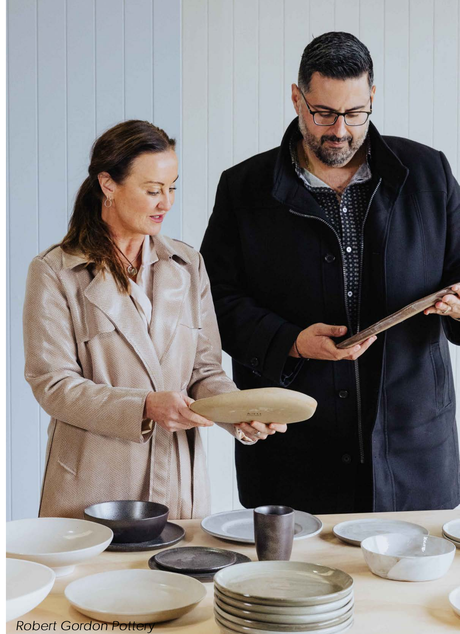
Robert Gordon Pottery