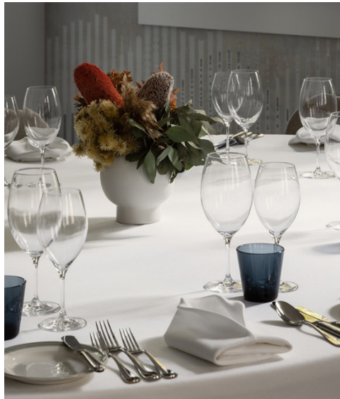
The Capella Hotel

Cedar Hospitality - where partnerships stand the test of time!