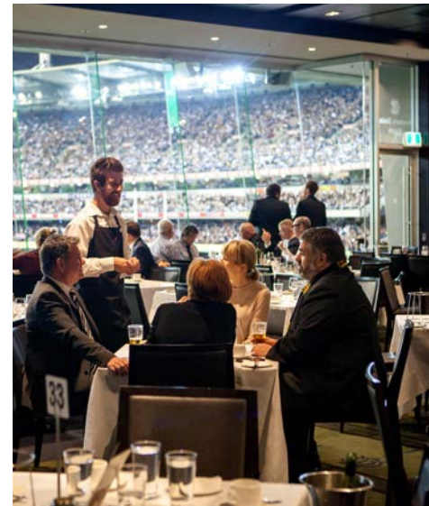
The Delaware North, The MCG