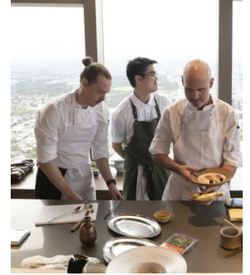
The Ritz-Carlton, Melbourne