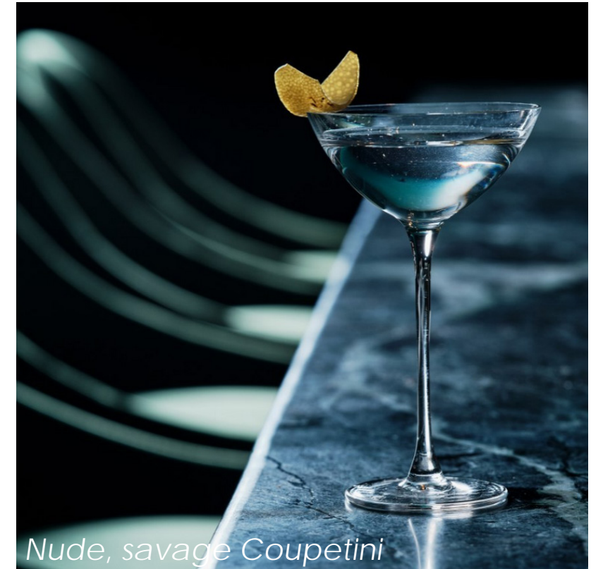
Nude, savage Coupetini

"I have been working with Cedar Hospitality and the team for more than 20 years. The personal service and their knowledge of whats best in market, is next to none. I would highly recommend Cedar to anybody in hospitality."