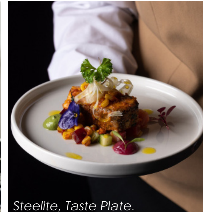
Steelite, Taste Plate.