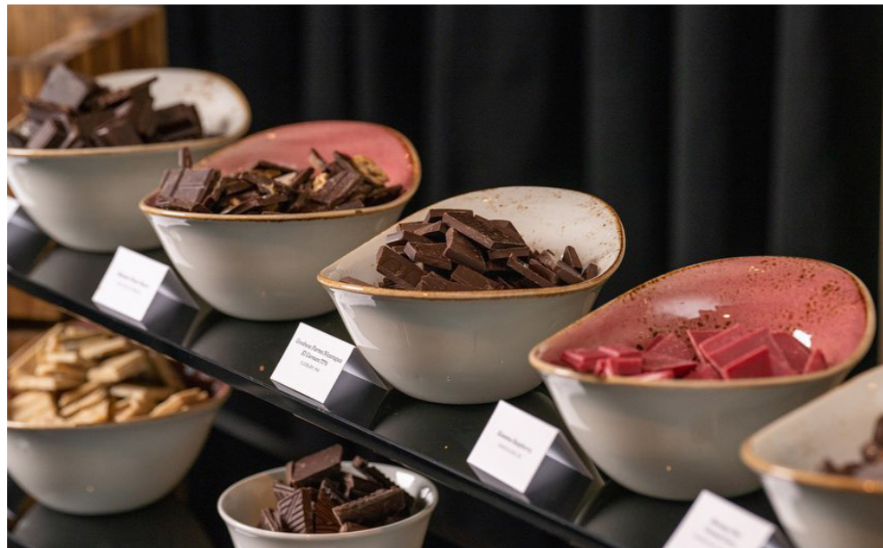
Steelite, craft freestyle Bowl.