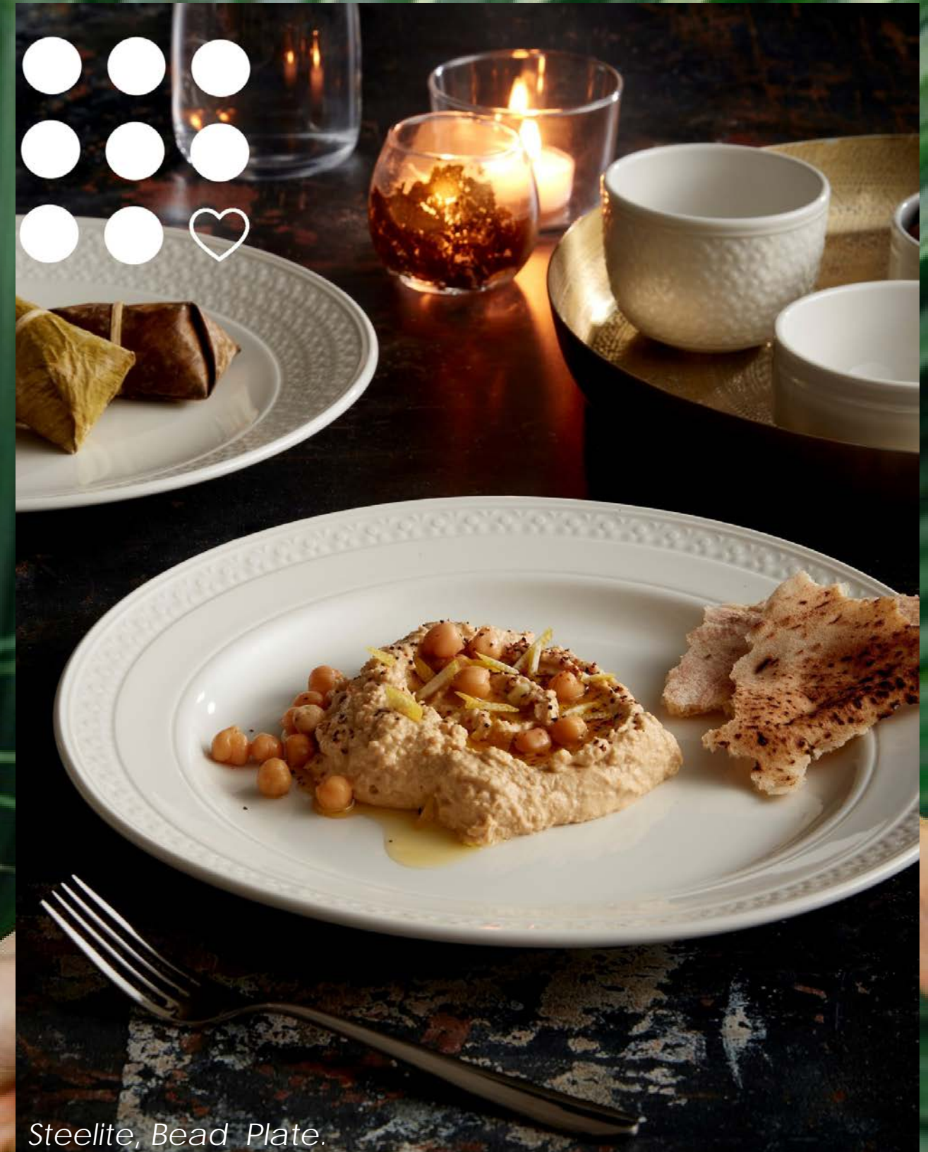
Steelite, Bead Plate.

Our mission is to be the leading supplier of hospitality equipment and supplies in the industry, and we achieve this by always putting our customers first.