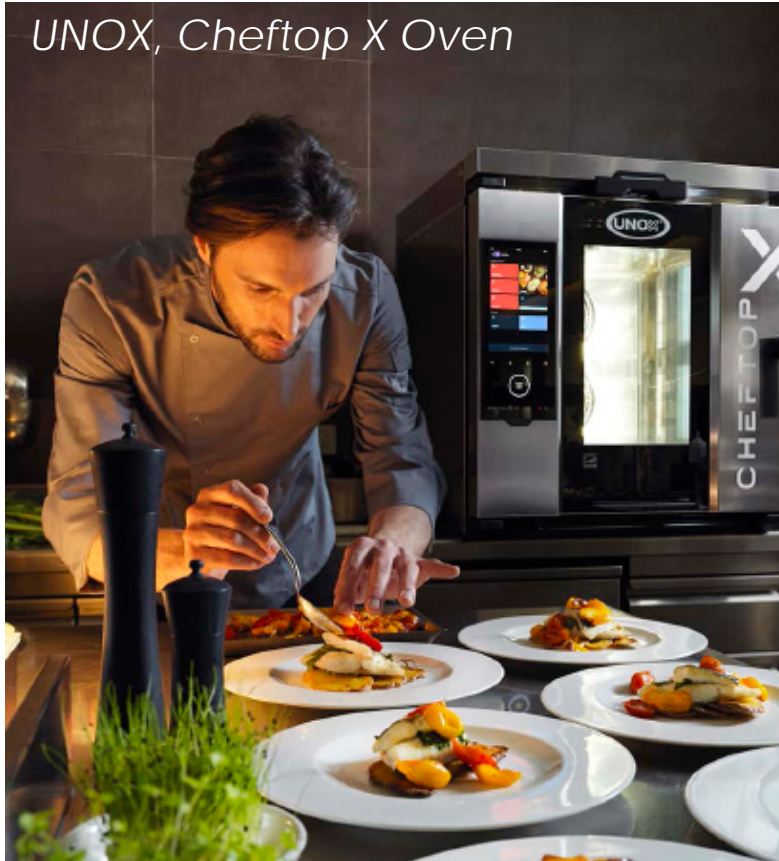
UNOX, Cheftop X Oven