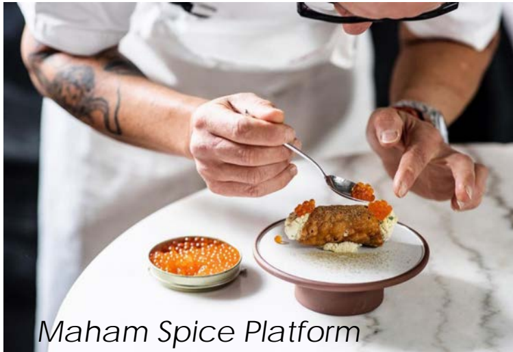
Maham Spice Platform