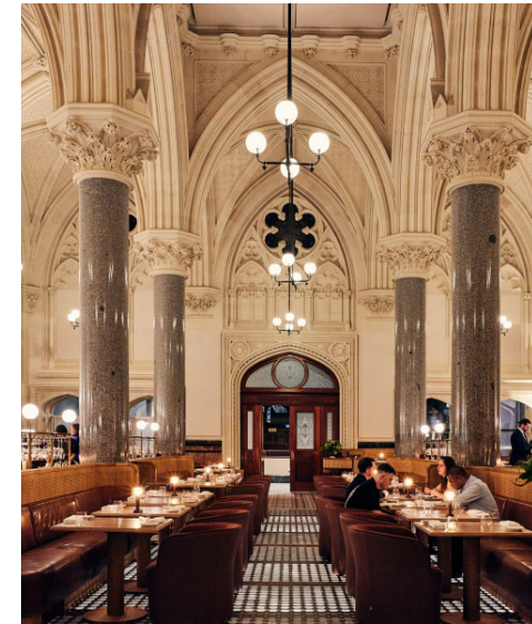
Reine La Rue