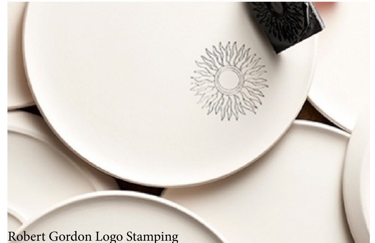
Robert Gordon Logo Stamping