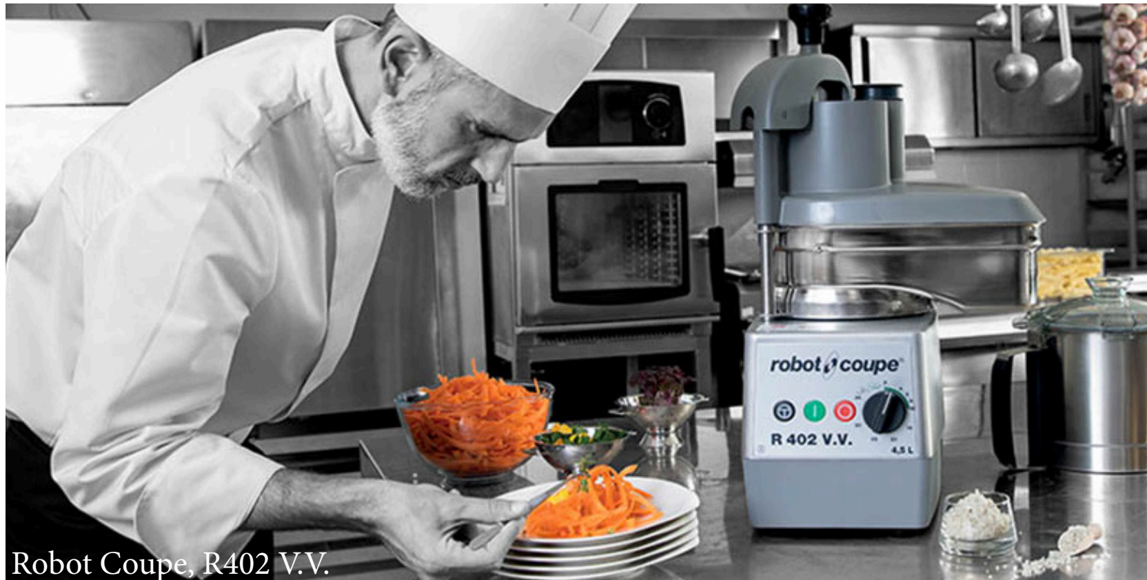
Robot Coupe, R402 V.V.

At Cedar, quality is at the heart of everything we do. We source the finest products from around the world to ensure your establishment exudes excellence. Our commitment to quality guarantees your guests a memorable and luxurious experience.