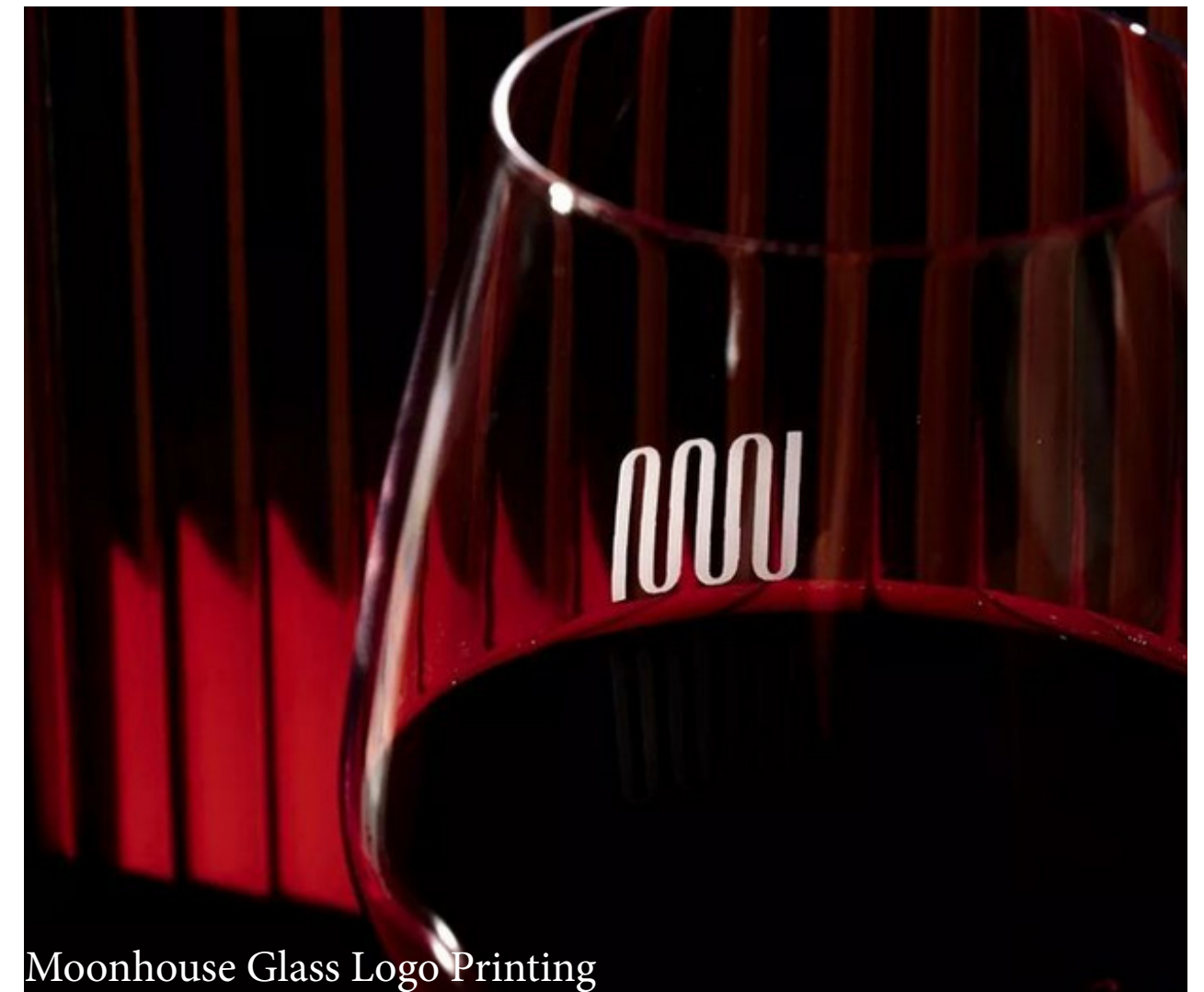
Moonhouse Glass Logo Printing