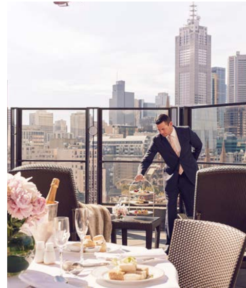
The Langham Hotel