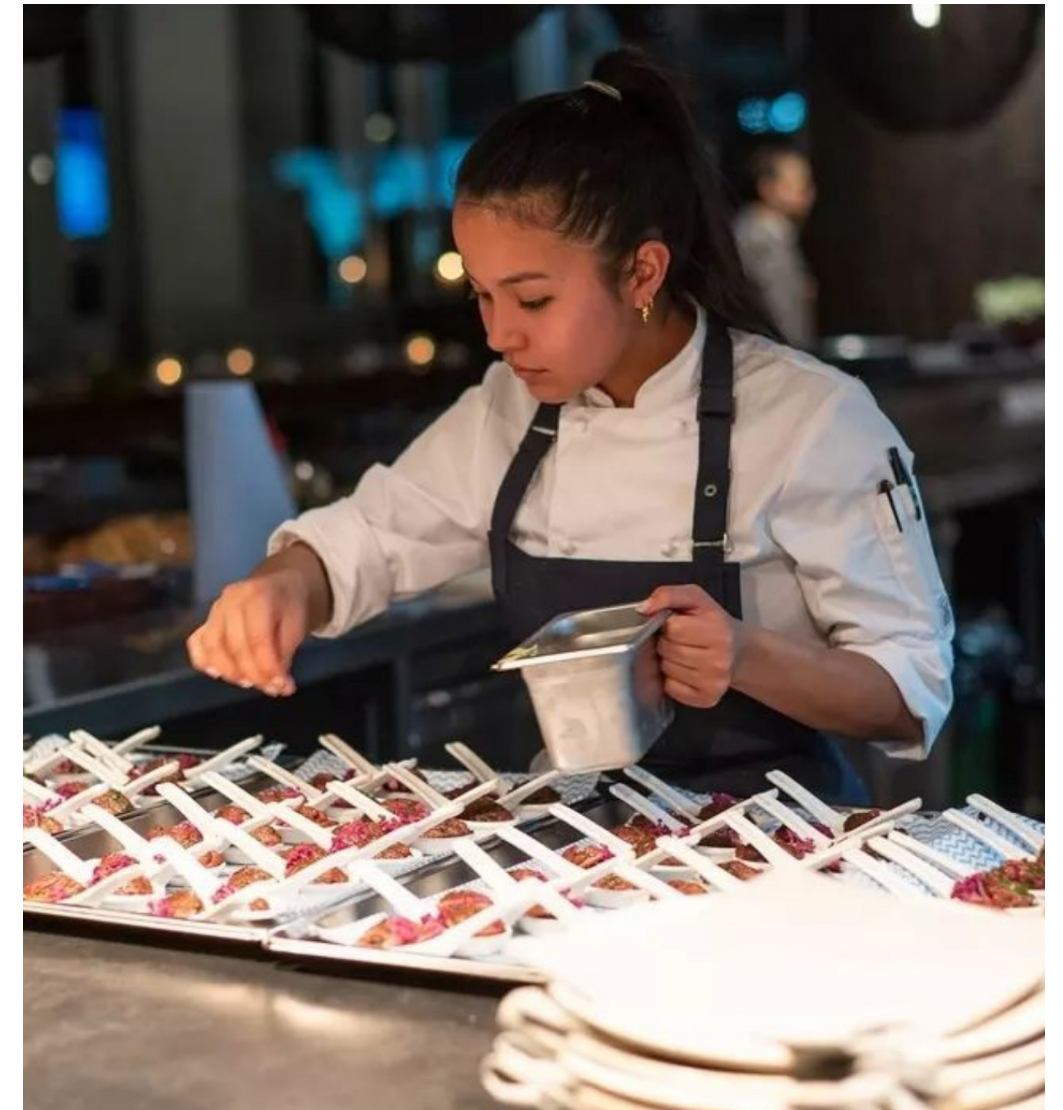
Chef's to account managers

No. 100 Flinders Lane, Homer Laughlin, Black Styleline