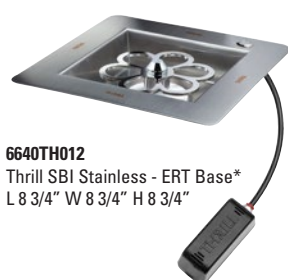
6640TH012 Thrill SBI Stainless - ERT Base* L 8 3/4" W 8 3/4" H 8 3/4"