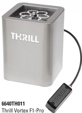
6640TH011 Thrill Vortex F1-Pro Stainless - ERT Base* L 7 7/8" W 7 7/8" H 10 1/8"

Thrill's new extended reach tubing (ERT) allows you to place the CO2 cylinder away from the bar area. Options for ERT are 30ft and 40 ft