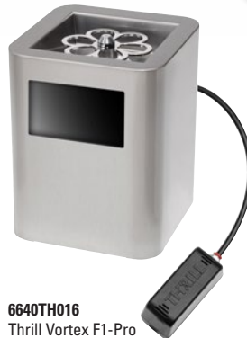
6640TH016 Thrill Vortex F1-Pro Stainless W/ 5" LCD Screen - ERT Base* L 7 7/8" W 7 7/8" H 10 1/8"