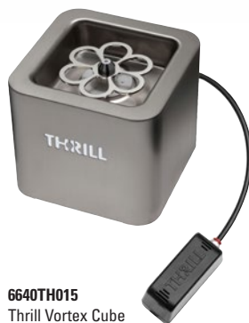
6640TH015 Thrill Vortex Cube Stainless - ERT Base* L 7 7/8" W 7 7/8" H 6 3/4"