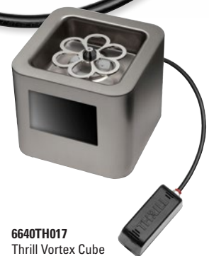
6640TH017 Thrill Vortex Cube Stainless W/ 5" LCD Screen - ERT Base* L 7 7/8" W 7 7/8" H 6 3/4"