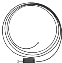
6640TH018 Thrill Vortex 30 Ft Extension Tube 6640TH019 Thrill Vortex 40 Ft Extension Tube